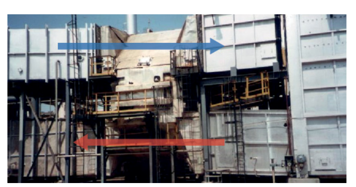
Prior arrangement with rotary regenerative type, several unexpected shutdowns and 15% leakage