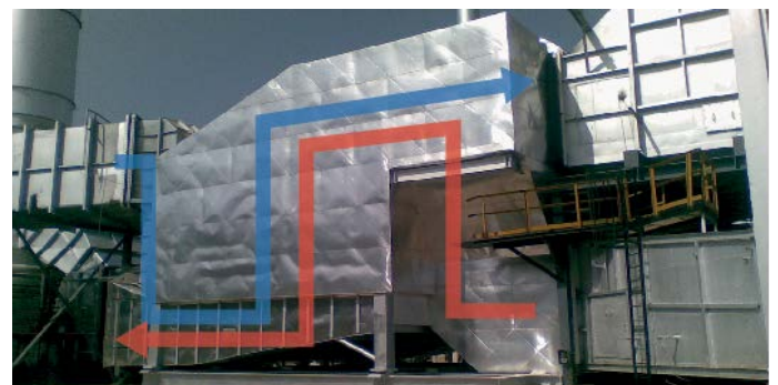
New arrangement with WAVE RECUPERATOR, no unexpected shutdowns, zero maintenance, achieved energy saving 134,000 MMBTU/a (39,260 MW/a)**

This brochure is for informational purposes and a non-binding description of our products and services only. Nothing in this brochure shall be construed or deemed as guarantee for specific performance specifications or suitability for specific operating purposes.