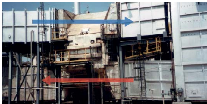
Prior arrangement with rotary regenerative type, several unexpected shutdowns and 15% leakage